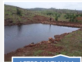
AFTER MATI NALA BANDH