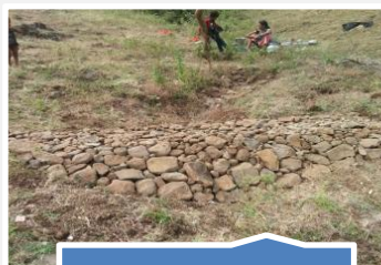
GULLY PLUG WORK