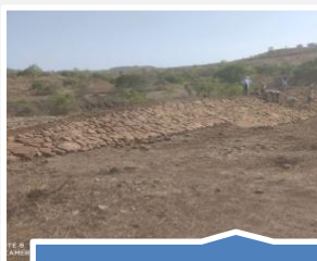
MATI NALA BANDH