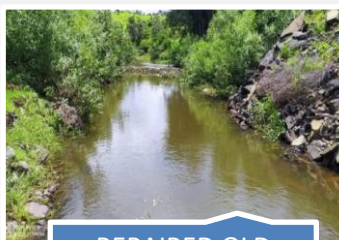
REPAIRED OLD WATER STRUCTURE