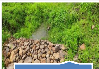
AFTER GULLY PLUG