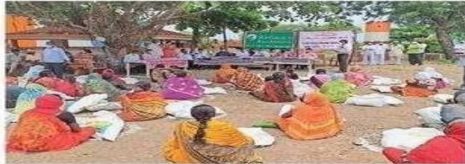
केज येथे रिलायन्स फाउंडेशन व जनविकास संस्थेच्या वतीने १२०० कुटुंबांना किराणा किटचे वाटप करण्यात आले.

मागील दोड वर्षापासून कोरोना महामारीच्या संकटामुळे सतत लागू करण्यात येत असलेल्या लोकडाऊनचा परिणाम छोटावामोठ्या उद्योग, भंडावर झाला आहे. अनेक उद्योग धंदे बंद पडल्याने अनेकांच्या हातातून रोजगार गेला असून हाताला काम नसल्याने अनेक गोरगरीब, मजूर कुटुंबे डबघाईला आली आहेत. अशा कुटुंबांना अनेक संकटांना तोंड देत जीवन जगावे लागत असून उपासमारीचा सामना करावा लागत आहे. त्यामुळे अशा कुटुंबांना मदतीची गरज आहे. हे ओळखून रिलायन्स फाउंडेशन आणि जनविकास