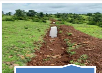
AFTER CCT WORK