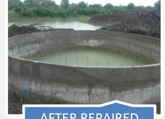
AFTER REPAIRED WELL